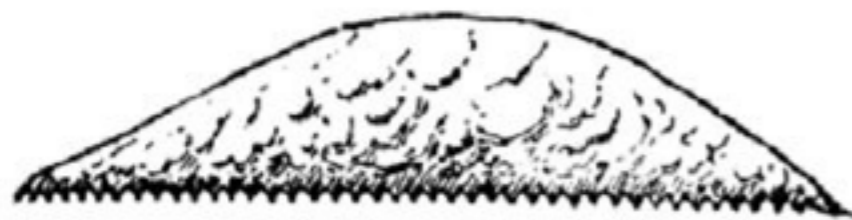
Saw-edged flint knife

For shredding plant fibres to make thread and fishing nets, and to punch holes in leather and wood.